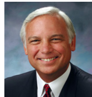
MEET JACK CANFIELD, CO-AUTHOR OF THE BESTSELLING CHICKEN SOUP FOR THE SOUL BOOKS

It’s because I’ve developed a talent (and a fool-proof system complete with hands-on exercises) for making absolutely sure students